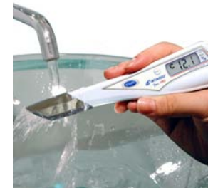
The PEN-Pro is fully waterproof and can be washed under the tap